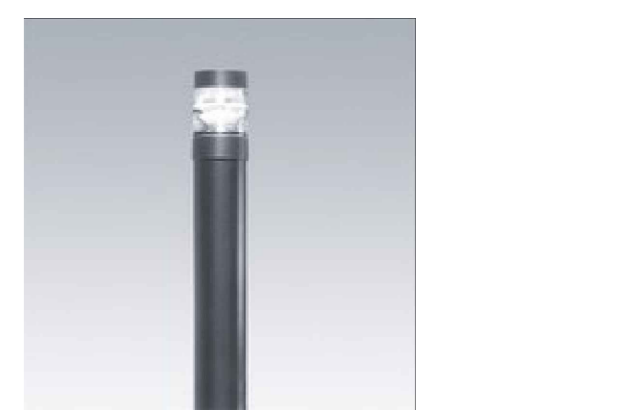
New Low Level Bollard THORN D-CO LED Bollard / D-CO LED BOLLARD 1000 30/50 830 CL1