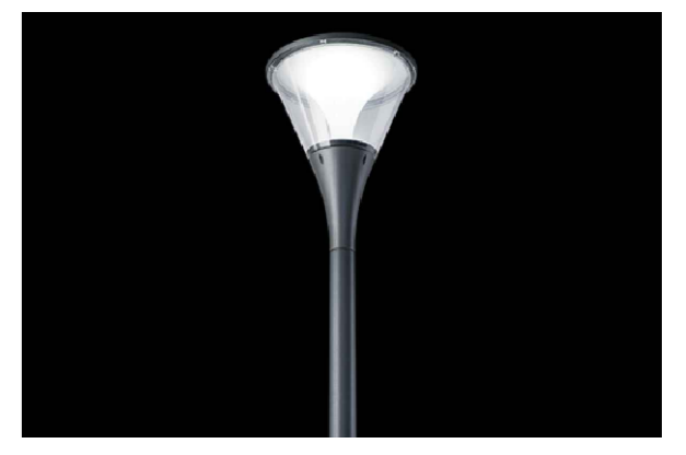
New Luminaire Glomax - C48 LED 4500 HF 830 CL/DP RL 57W at a mounting height of 6 metre